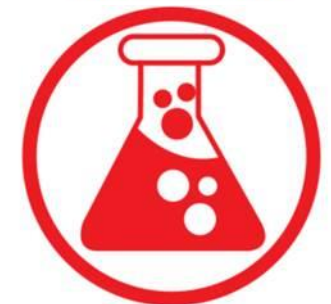
STEM Science, Technology, Engineering and Math