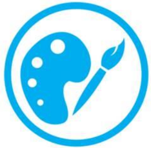
Arts & Humanities