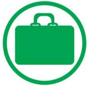
Business & Industry